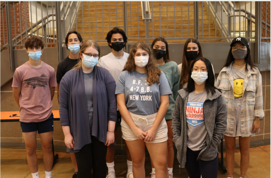
National Merit Commended Students