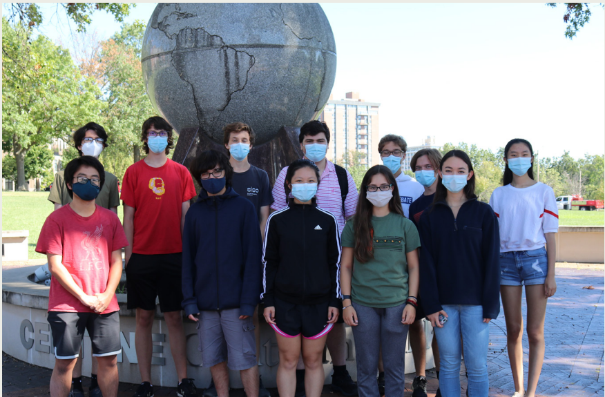
National Merit Semifinalists

Sixteen students have been selected as 2022 National Merit Commended Students. They are being honored for their excellent performance on the Preliminary SAT/National Merit Scholarship Qualifying Test (PSAT/NMSQT®) and placing among the top 50,000 students in the competition. Although they will no longer be in the competition for the National Merit Scholarships, we as a District are extremely proud of their academic achievements. •