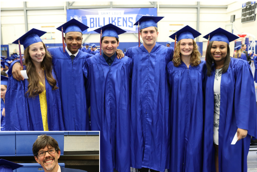
Above: Members of the Class of 2019 pose for a photo prior to the start of their commencement ceremony.