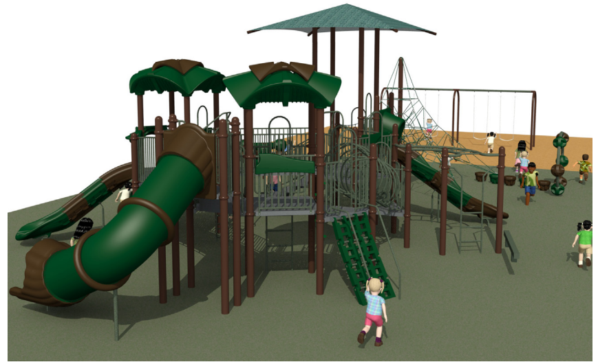
Phase one of the new Meramec Elementary playground (above) is slated to be completed in August, with a nature area scheduled for completion by the end of the 2018-2019 school year.

The Family Center's new play space under construction this summer also dovetails with the school's focus on nature education. Phase one of the upper playground renovation adjacent to the school's urban forest includes the installation of swings, a geodesic climbing dome, hand-over-hand bars and a sunshade. The school is continuing to fundraise for the second phase of the upper playground renovation, which will include a mud kitchen, sandbox and tunnels.