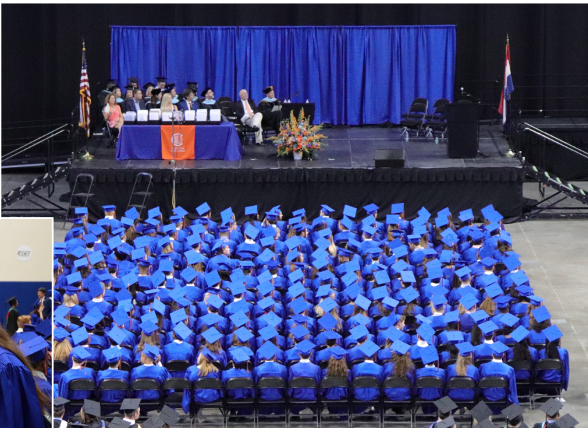
Far right: The Class of 2018 gathers at Chaifetz Arena for the commencement ceremony on May 31.