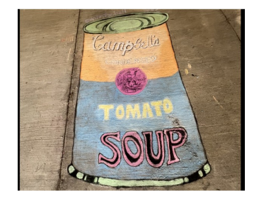
Bean Calsyn's Warhol inspired Soup Can